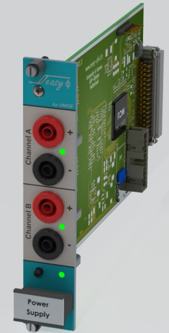
Dual Precision Power Supply